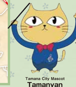
Tamana City Mascot Tamanyan